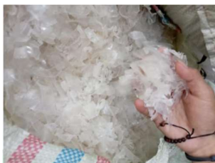
Figure 1. Polypropylene (PP) Plastic

The primary materials used in this study consisted of polypropylene (PP) plastic waste and natural fine aggregate (sand). The polypropylene plastic waste was sourced from discarded household plastic products, such as packaging containers and consumer goods, which are commonly available in municipal solid waste streams. Prior to use, the collected PP waste underwent a systematic preparation process, including manual sorting to remove impurities, thorough washing to eliminate dirt and organic contaminants, and drying at ambient conditions. The cleaned plastic waste was then mechanically processed into smaller particles to achieve a size suitable for homogeneous mixing with the fine aggregate. The natural fine aggregate used in this study was river sand, selected due to its widespread application in paving block production. The sand was sieved and characterized to ensure compliance with the relevant Indonesian standards (SNI) for grading, cleanliness, and particle size distribution required for paving block manufacture. An example of the polypropylene plastic waste utilized in this study is presented in Figure 1.